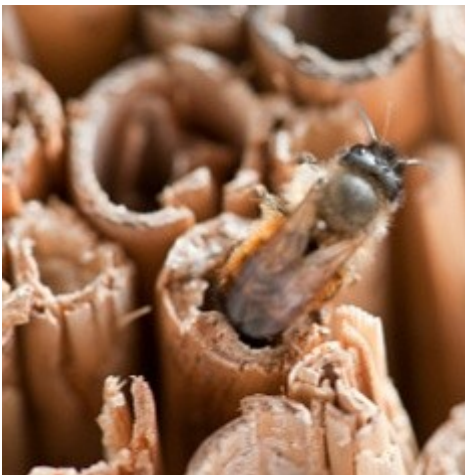
Female Red Mason Bee in a nesting stem (left) and Bumble Bee (right).