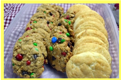
SNACKS! Always a hit!!!