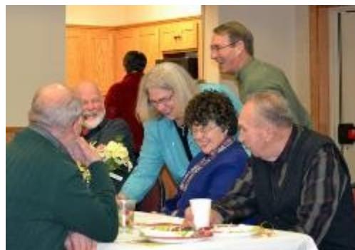
Some unusual botanical hybrids were discussed after dinner, but they probably will not show up in the annual Plant Sale.