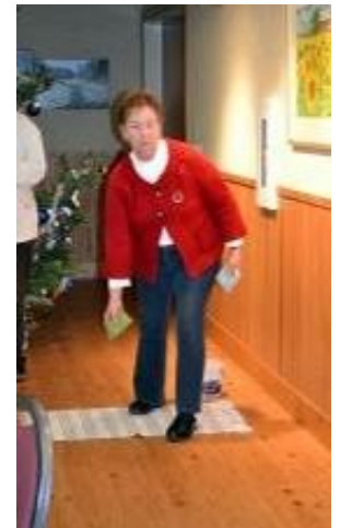
Can you tell who has the best bean bag tossing technique?