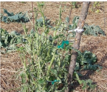
A damaged tomato plant (left) and hail-battered zucchini (right) a day after the storm.

Although of significantly less value than the PARS experimental plantings or commercial crops, The Garden Door plants and art were also damaged by the hail. Vegetable plots in the Garden Next Door (GND) were also severely damaged. Within two weeks of the storm, however, it was apparent that most of our plants will probably survive. Many are started to sprout and grow again. Although seeing the damage to our showcase gardens was initially shocking, it is clear that we have much to be grateful for, as demonstrated by the resilience of the plants in the gardens. Following the storm, many visitors to TGD and GND commented on how beautiful it had been during the Open House and wished us continued success. We are also grateful to friends who donated plants to help us replace damaged plants to provide veggies for the Taste of TGD. We thank Larry Maas, who donated not only the original plants but the replacement plants after the hail for the big pot in the Succulent Garden at TGD. Continued thanks to all the MGV's who devote time and effort to maintain TGD gardens and GND plots through sun or hail.