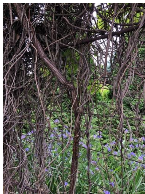
Work will continue this summer to remove the Akebia vine from the tunnel.

This summer the Invasive Species Team will assist with further treatments. Nothing can be planted in the area until next year.