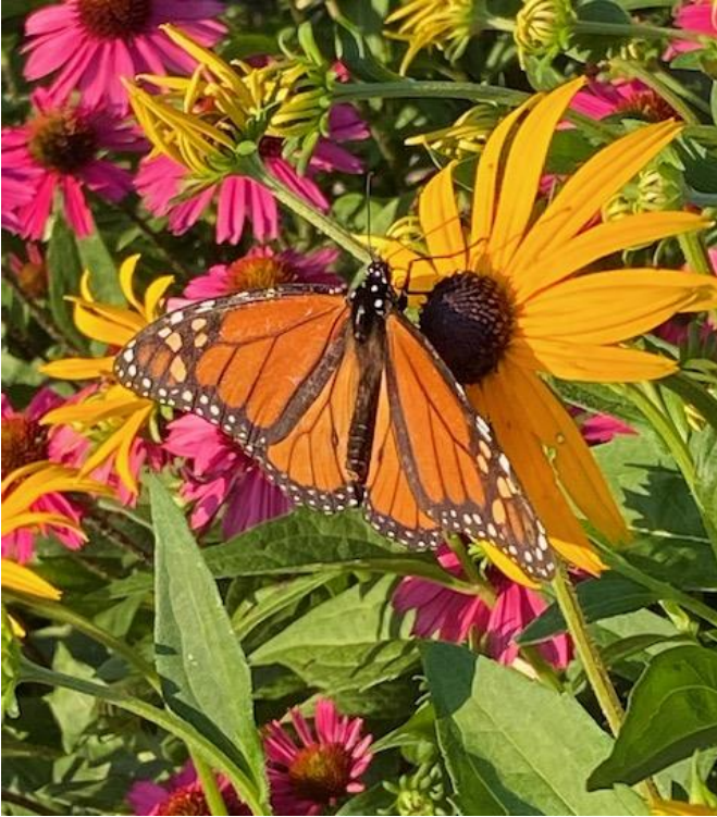
A feast for a monarch! (Sue Kunz)

Quite a few of our members' photos featured Monarchs and other butterflies visiting their gardens. Here are several of them.