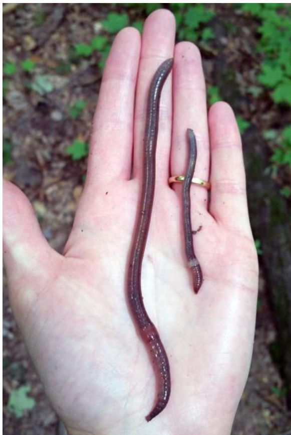
A UW-Madison photo shows a night crawler on the left and one of three jumping-worm species found in Wisconsin on the right. This one is smaller than the crawler, but the distinguishing characteristics are the white band and the way it thrashes like a snake when touched. Submitted.