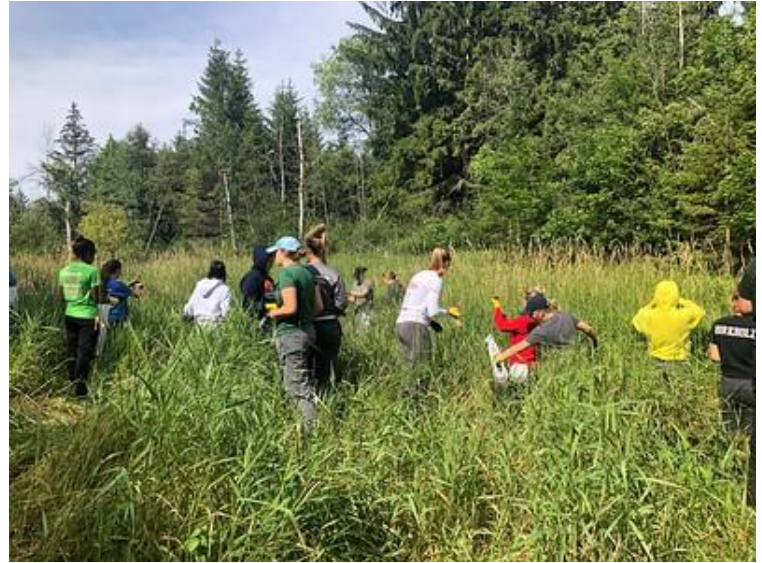
Habitat Healers clip seed heads from invasive Reed Canary Grass.

So far this year, Crossroads staff, contract restoration specialists and Habitat Healers have planted and cared for 1700 bare-root native trees and shrubs, 274 larger potted or balled-and-burlapped native trees and shrubs, and 1600 native plugs. Currently, tree planting (to reach the goal of 4000 trees and shrubs) is underway.