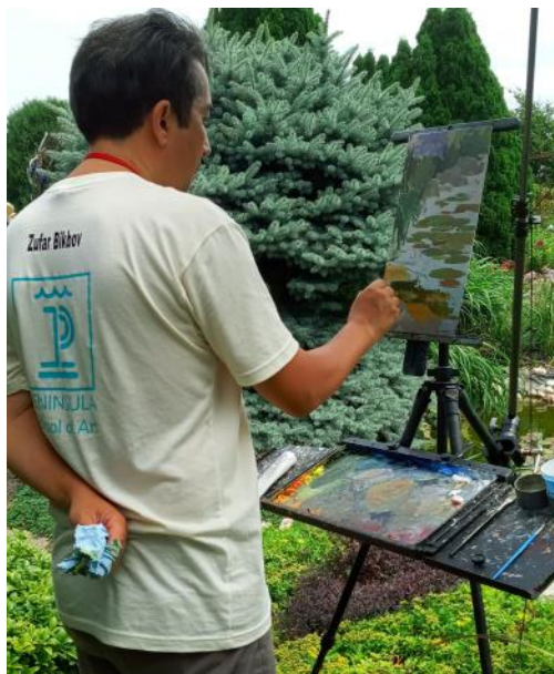
Left: Capturing the beauty of the pond.