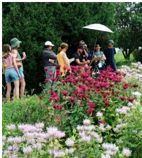
Below right: Painting at the confluence of the Peony and Perennials Gardens.