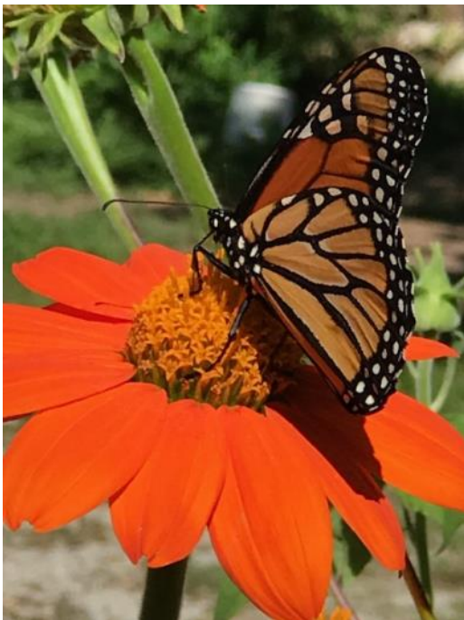
Mexican Sunflower (Tithonia) is a butterfly magnet. (Linda Monahan)