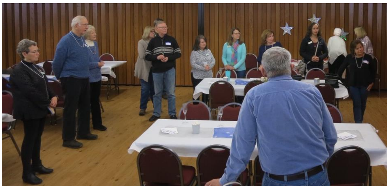
Below: class members introduced themselves to the group.