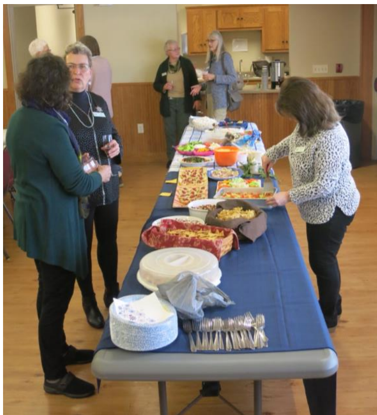
Above: as always, lots of delicious food!

About 55 people attended the Meet and Greet event in January, to get to know the twelve new students in the 2020 class. There was lots of socializing, introductions, free seeds, a special "Silver trivia game," lots of prizes, and plenty of laughs. Kudos to members of the social committee who did an awesome job of decorating, set up and clean up.