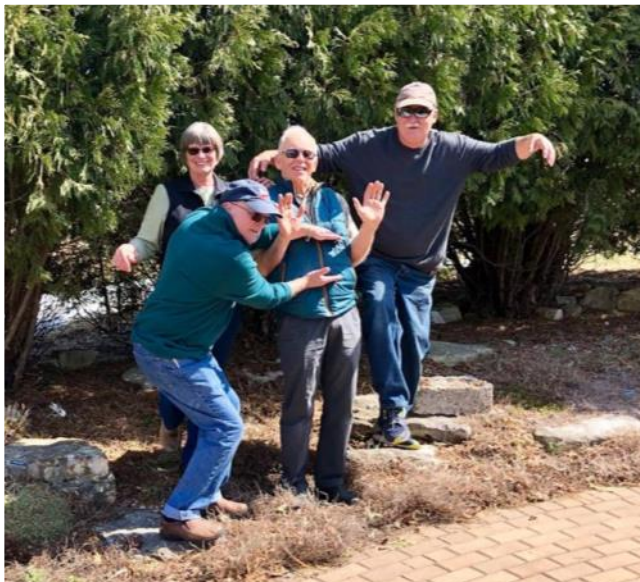
Artists' rendition of the design for the new donation box. Use your imagination.

The work of The Garden Door Committee blooms and comes to fruition during the summer, but seeds are planted well ahead. Here are highlights of meetings earlier this year: