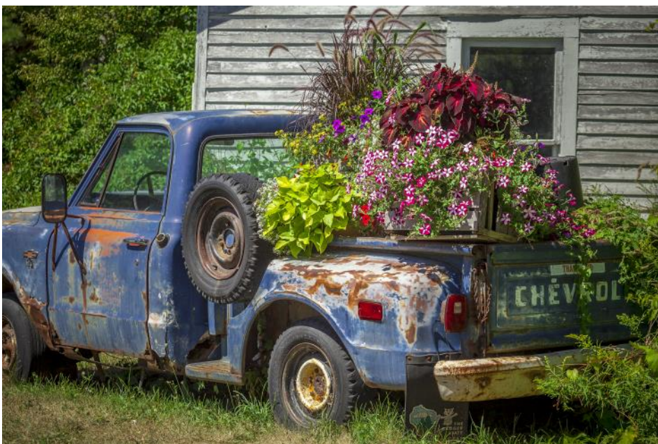
“Arty Surprise”