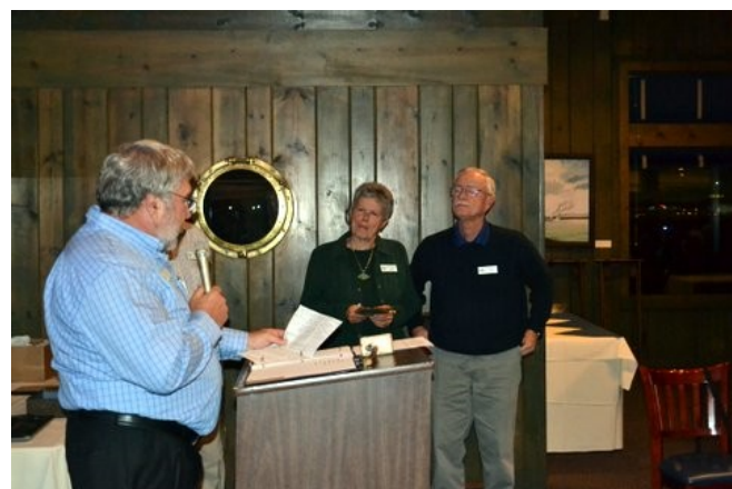
A number of members were recognized for outstanding service to the organization.